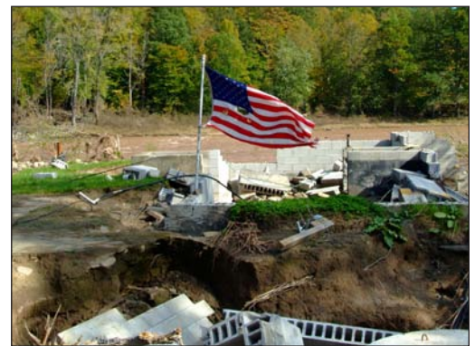
Esperance, N.Y., September 26, 2011 — Residents along Priddle Road suffer a total loss of structure due to heavy flooding caused from Hurricane Irene and Tropical Storm Lee.

Flood damages were severe in many communities, as the Susquehanna River hit a new record, exceeding the benchmark flood for the region set by Hurricane Agnes in 1972 by nearly two feet. Floodwalls in downtown Binghamton, N.Y., were